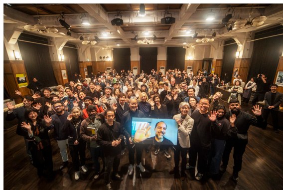
Award Ceremony 2025

Federico Estol will have an exhibition at SHIMADAI GALLERY East as part of the Main Program of KYOTOGRAPHIE International Photography Festival 2026.