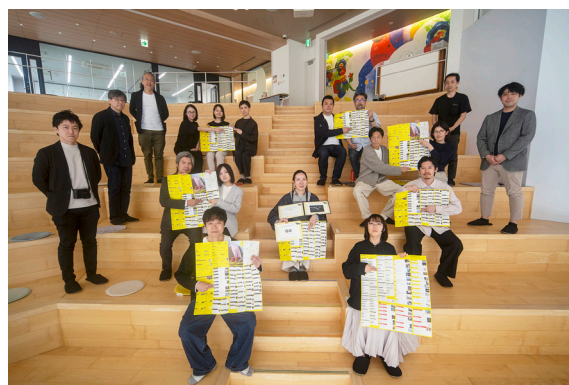
KG+ DISCOVERY Award 2025 Presentaion

SIHIT80 will have an exhibition as part of the KG+ SPECIAL Exhibition 2026.