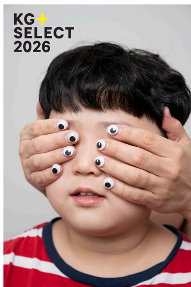
KG+SELECT 2026 Finalist

<News Flash> The finalists for the juried exhibition KG+ SELECT have been decided!